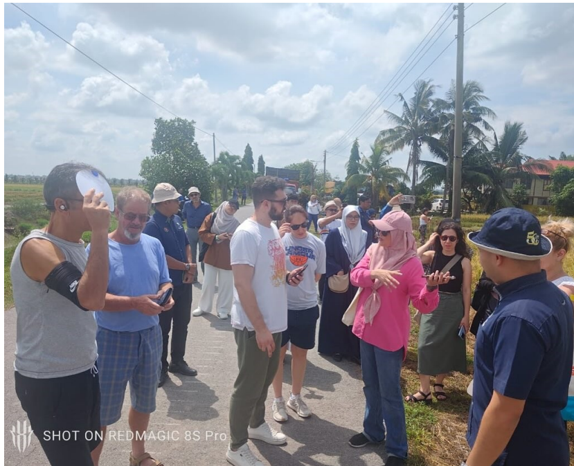
Figure 21: Explanation about the paddy industry

witnessed firsthand the intricate process of rice farming that sustains the local community. Participants were given the opportunity to learn about the cultivation cycle, from planting to harvesting, deepening their appreciation for Malaysia's agricultural traditions.