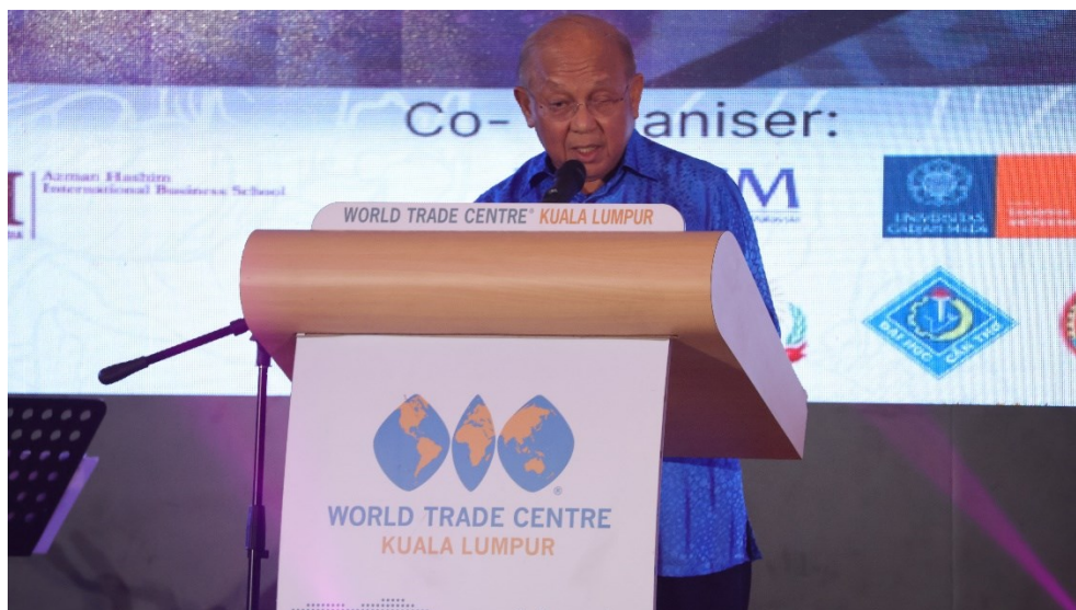
Figure 16: Tan Sri Azman Hashim

The highlight of the evening was the closing ceremony of the ANGEL Erasmus+ CBHE project, a key milestone that acknowledged the contributions of ASEAN and EU partners in promoting green entrepreneurship and leadership. In his closing remarks, Tan Sri Azman Hashim, Chairman Emeritus and Honorary Adviser of Ambank Group, emphasized the key takeaways from the ANGEL conference, underscoring its impact on sustainability and innovation.