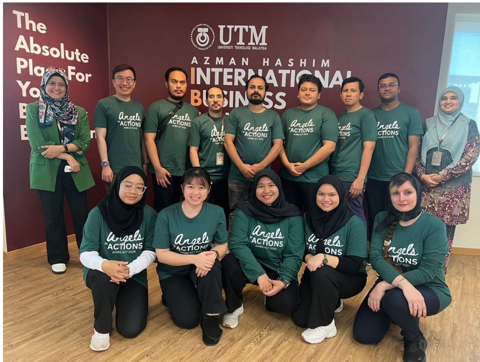
Figure 2: The Students' Volunteers

Students' volunteers were selected among the postgraduate students in Azman Hashim International Business School. In total we have 15 students' volunteers who have helped in supporting the conference management.