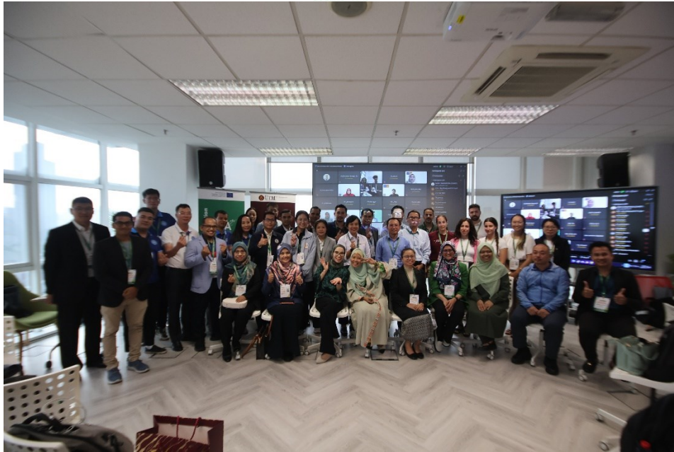
Figure 4: Group photo of ANGEL Innovation Competition