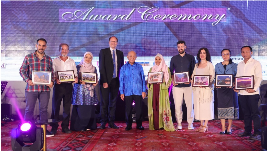
Figure 18: With some of the ANGEL partners

Under the theme 'Istimewa', the dinner offered a unique opportunity for attendees to network and engage in informal discussions with industry experts, academic professionals, and peers.