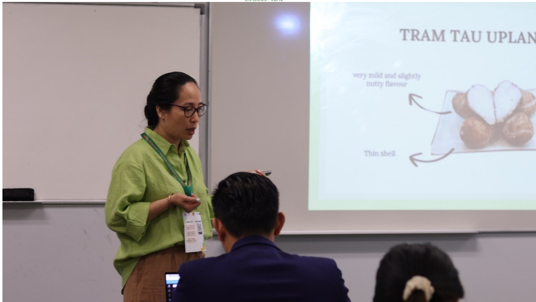
Figure 12: Case Study Presentation

The parallel sessions allowed participants to explore specific topics in greater depth and engage more closely with others who shared similar interests and perspectives. These sessions were efficiently managed by student volunteers and AHIBS staff.