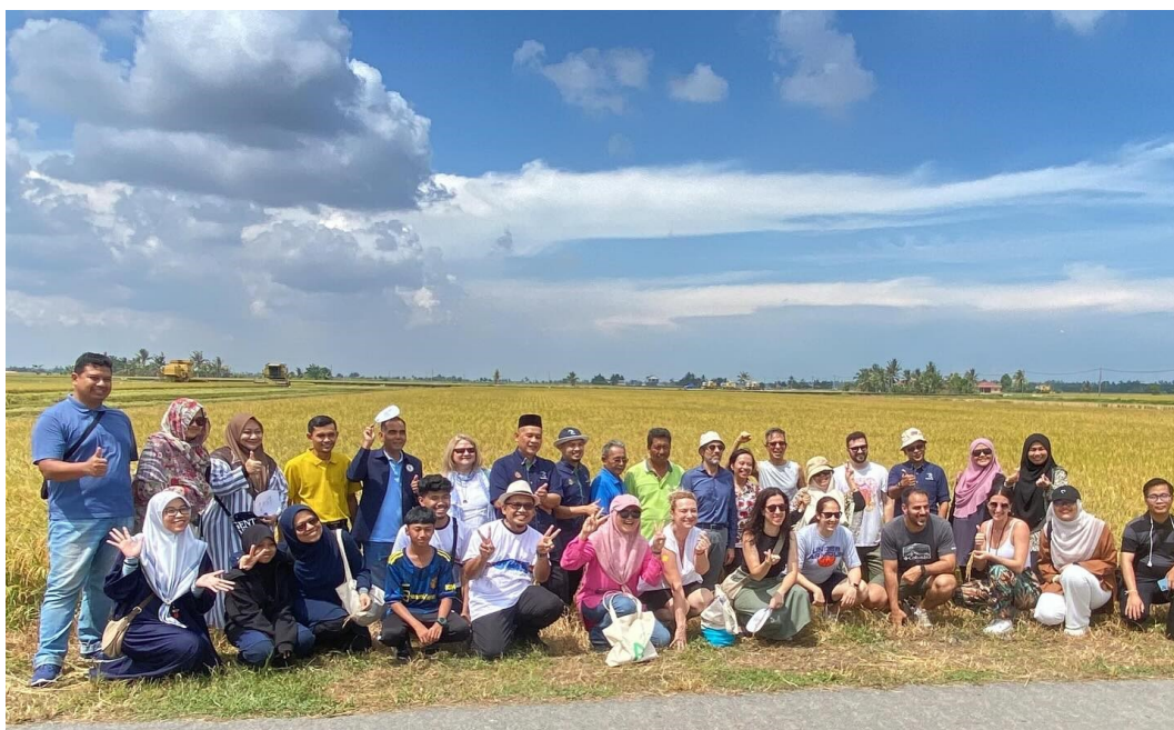
Figure 20: In front of a paddy field

As part of an initiative to foster cultural exchange and immerse participants in Malaysia's rich heritage, members of the ANGEL Erasmus+ project embarked on a journey to Sekinchan, a charming town located in the state of Selangor. Sekinchan is renowned for its picturesque paddy fields, traditional fishing village, and stunning natural landscapes. The town is particularly famous for its vast stretches of paddy fields, which form a beautiful mosaic of lush greenery, offering breathtaking views that extend as far as the eye can see. These rice fields not only serve as the backbone of Sekinchan's economy but also attract photographers, tourists, and those seeking a peaceful escape from urban life.