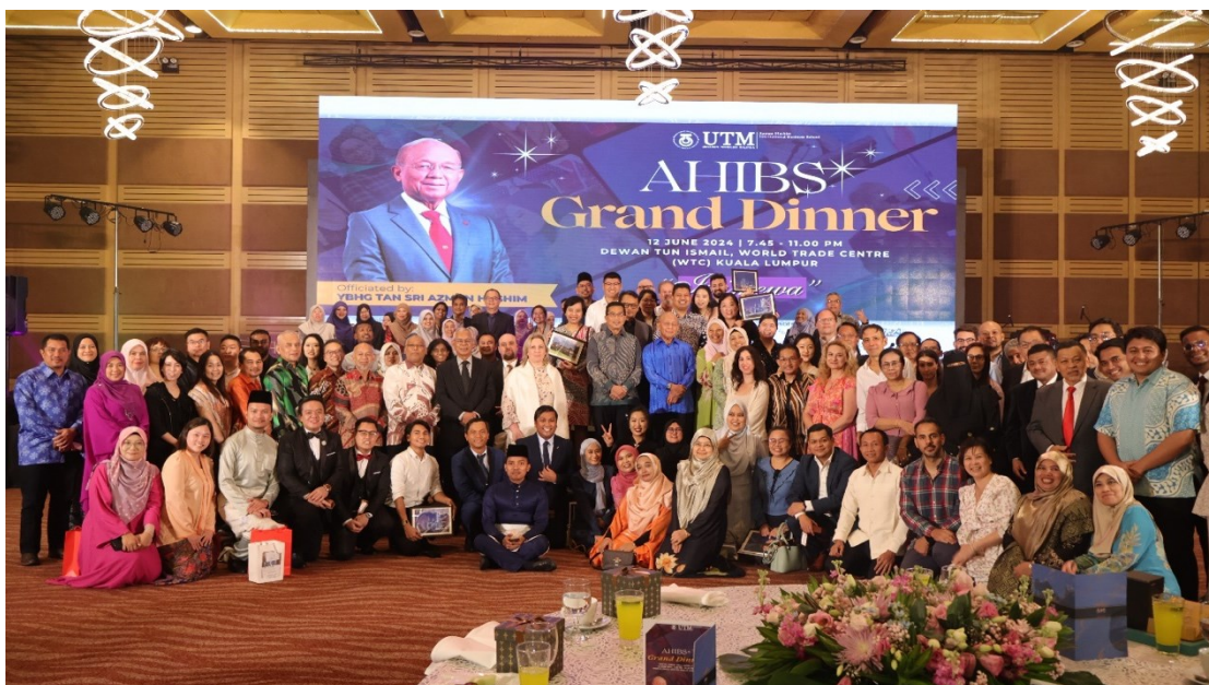
Figure 19: Group Photo

Under the theme 'Istimewa', the dinner offered a unique opportunity for attendees to network and engage in informal discussions with industry experts, academic professionals, and peers.