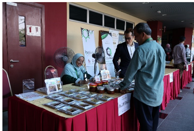
Figure 24: Industry showcase

With its innovative theme and multidisciplinary approach, AIC 2024 has attracted attention from academic journals, industry reports, and news outlets, significantly enhancing the visibility of the topics and research presented. Attendees and speakers had the opportunity to network with global peers, fostering relationships that can lead to future collaborations. These connections extend the influence of individuals and institutions well beyond the event, creating lasting professional and