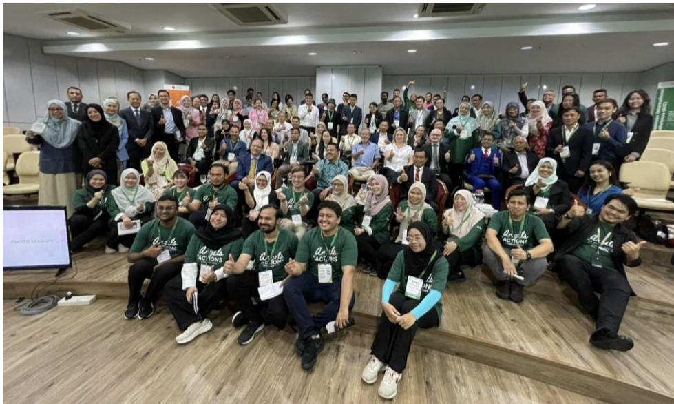
Figure 7: Group Photo

The AIC 2024, with its emphasis on green entrepreneurship and leadership, aligns with the nation's priorities on sustainability. The ANGEL Erasmus+ CBHE project is vital in advancing the sustainable development agenda. By bringing together international partners, industry experts, academic scholars, and marginalized communities, this conference embodies the collaborative spirit necessary to address global sustainability challenges.