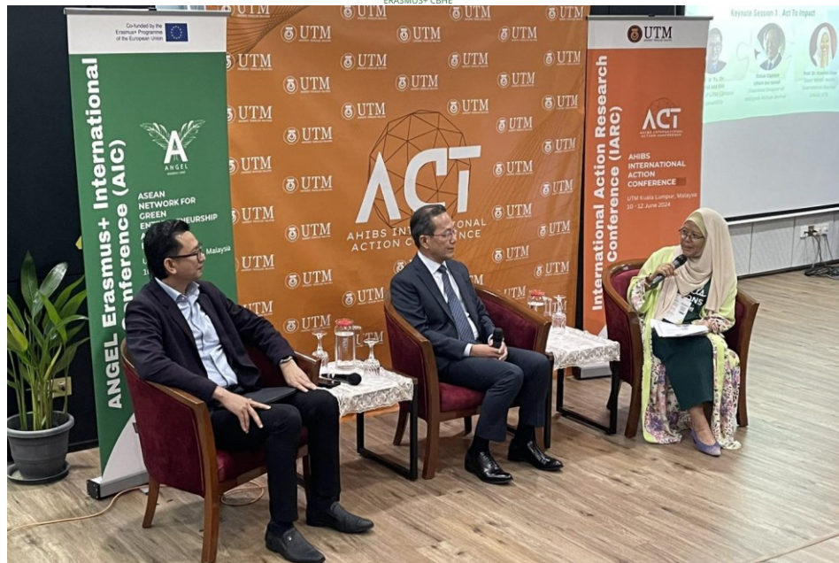
Figure 9: The plenary session 1