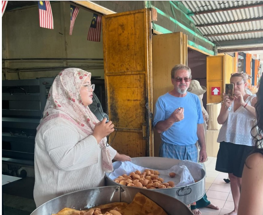
Figure 22: Trying traditional cake by local entrepreneurs

This cultural immersion in Sekinchan not only strengthened the bonds between ASEAN and European partners but also offered participants a unique perspective on the sustainable agricultural practices that are integral to Malaysia's economy and heritage.