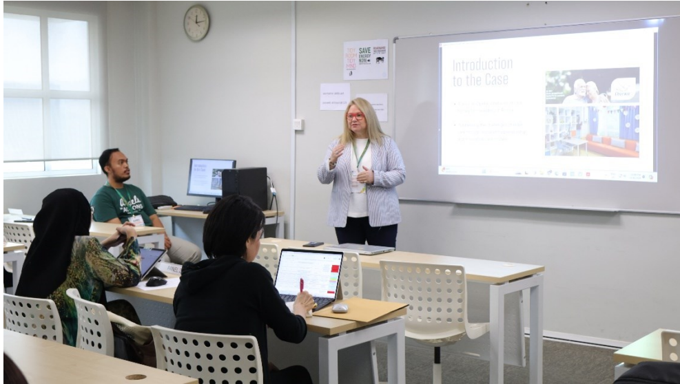
Figure 14: Case Study Presentation

Additionally, the teaching cases were published as part of the conference proceedings, complete with an ISBN number, contributing to the conference's outputs for dissemination and publication.