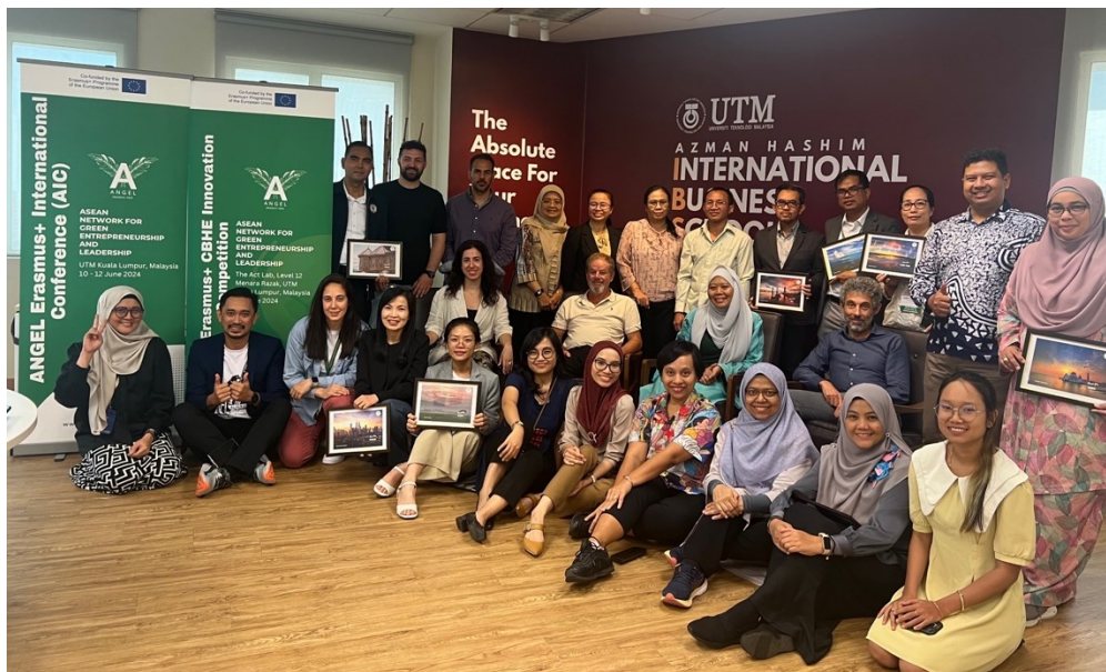
Figure 23: Group photo after the end of the meeting

During the meeting, the team reviewed the pending work packages and their respective timelines. Each work package was thoroughly evaluated to ensure that all tasks and objectives were addressed appropriately. A significant focus was placed on the efficient allocation of responsibilities and resources to ensure the timely completion of all remaining tasks. The meeting served as a crucial step in coordinating efforts to meet the project's deadlines and to ensure the successful delivery of all conference commitments.