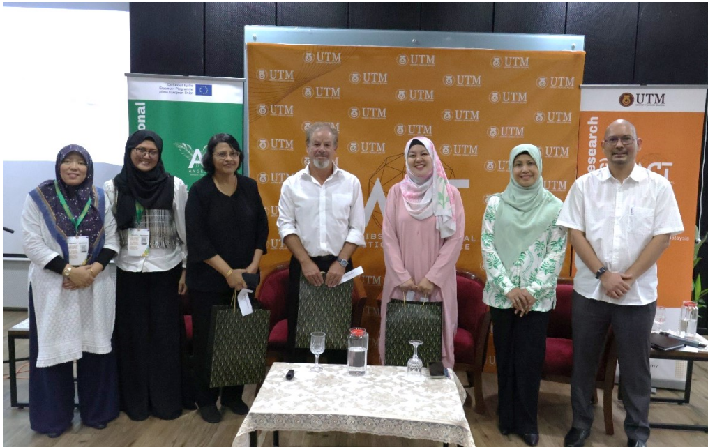
Figure 11: with all the speakers and moderator