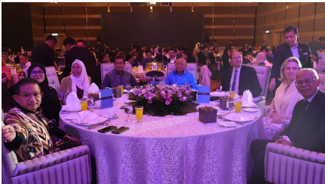
Figure 17: Distinguished guests at the conference