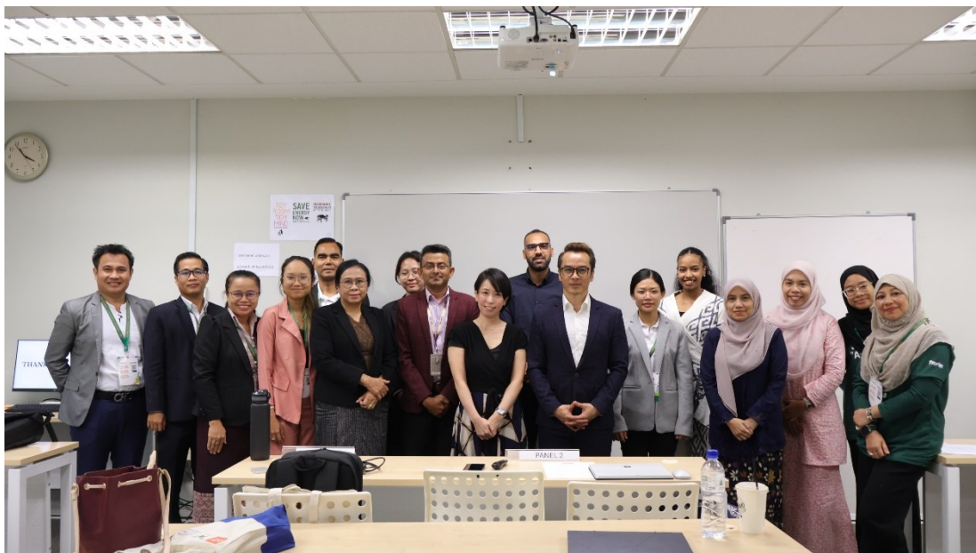
Figure 13: Group Photo

The parallel sessions allowed participants to explore specific topics in greater depth and engage more closely with others who shared similar interests and perspectives. These sessions were efficiently managed by student volunteers and AHIBS staff.