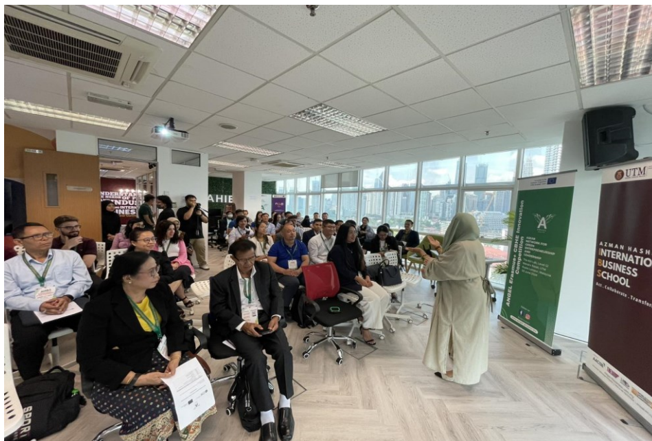
Figure 3: ANGEL Innovation Competition

The competition featured participation from 12 teams representing institutions such as Universiti Teknologi Malaysia (UTM), Universiti Malaysia Kelantan (UMK), Universiti Tun Hussein Onn Malaysia (UTHM), Gadjah Mada University (UGM), Indonesian Islamic University (UII), University of South-East Asia, Institute of Technology Cambodia, Royal University of Phnom Penh, Savannakhet University, Champasack University, Can Tho University, and Ha Noi University of Mining and Geology.