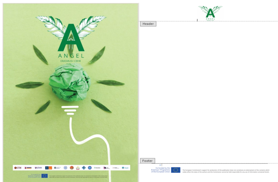
Figure 2 - ANGEL Word Template

For documents created with Word editing software, it is advised to follow the format provided below. This template is suitable for short articles and recommendations.