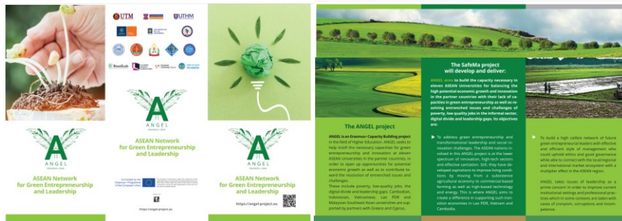
Figure 4 - ANGEL ANGEL Flyer

For flyers, it is recommended to follow the format provided below. This template is ideal for concise informational materials and recommendations.