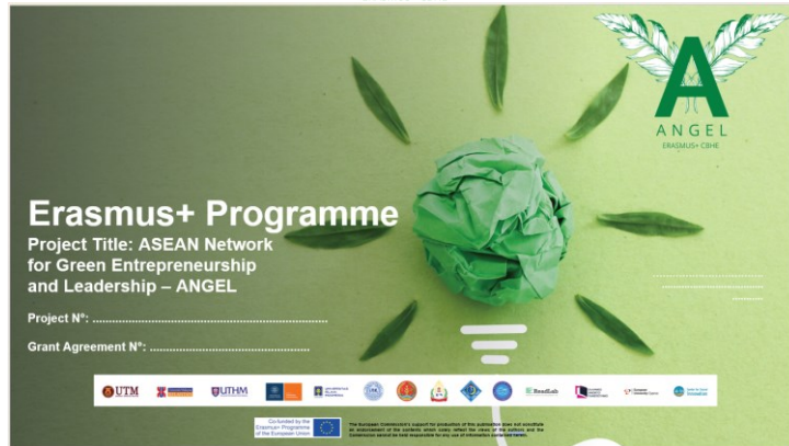
Figure 3 - ANGEL PowerPoint template