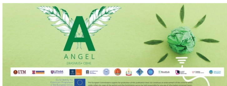
Figure 5 - ANGEL Facebook Coverage

For Facebook cover pages, it is recommended to follow the format provided below. This template is ideal for creating eye-catching covers and recommendations